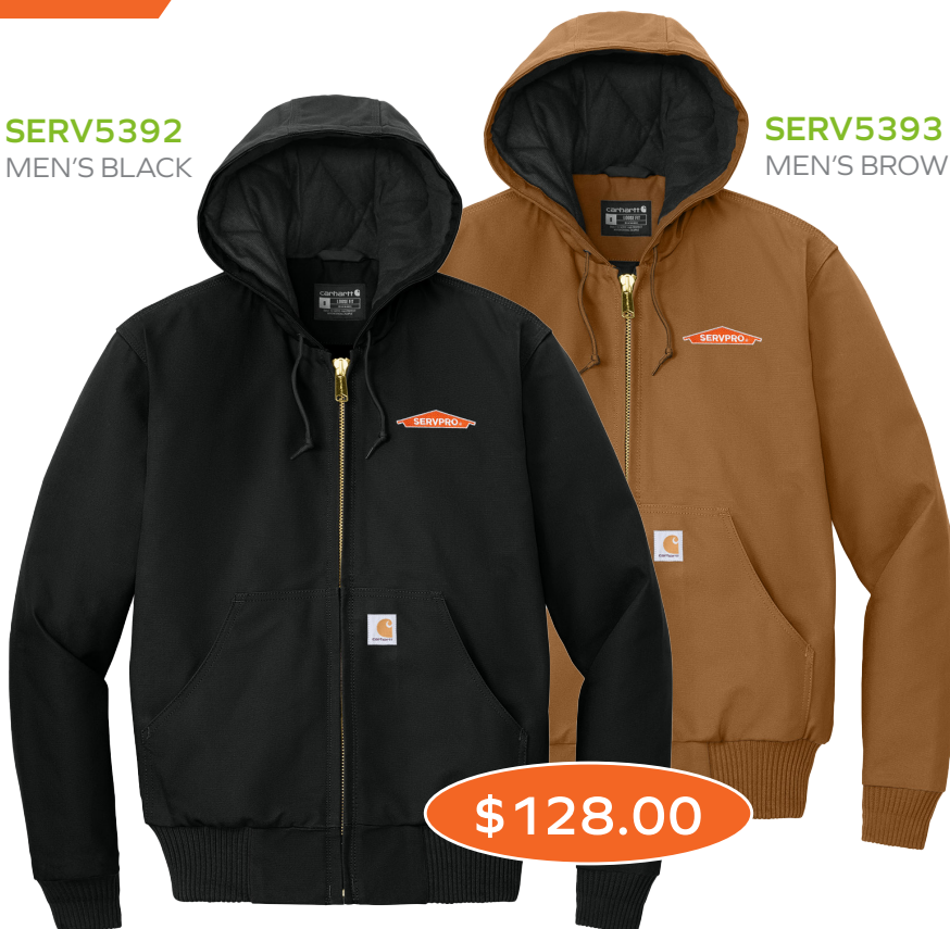
SERV5393 MEN'S BROWN

*Additional charges apply for jackets 2XL and up.