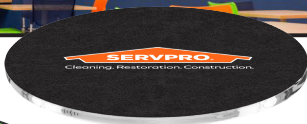
SERV9047 PUB TABLE