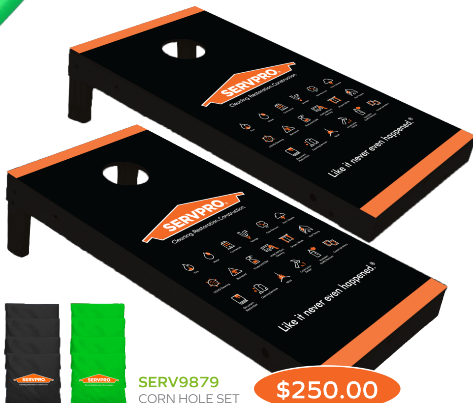
SERV9879 CORN HOLE SET