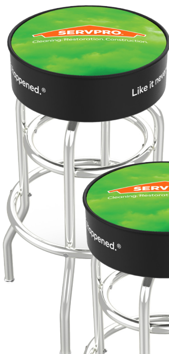
SERV1511 SHOP STOOL WATER