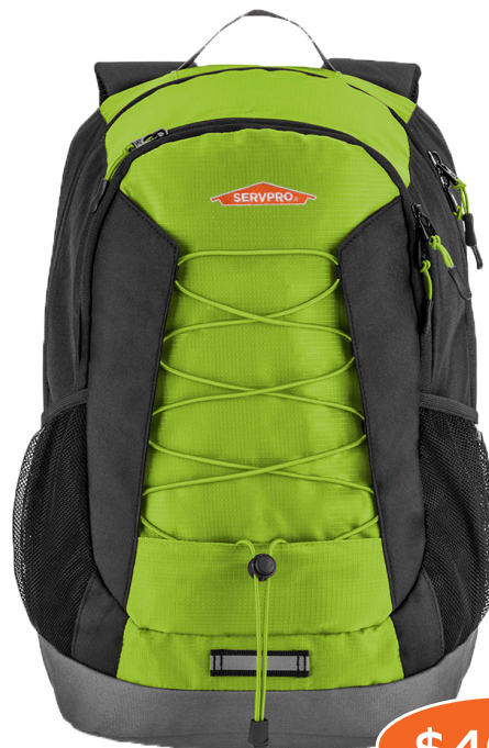
SERV9013 BASECAMP ASCENT BACKPACK

Zip through security with this pack that features a laptop compartment that lies flat on the screening belt. Checkpoint-friendly, top-entry padded laptop compartment, organization panel, large main compartment. Laptop sleeve fits most 17" laptops.