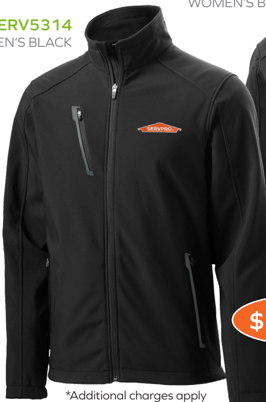
SERV5314 MEN'S BLACK

*Additional charges apply for shirts 2XL and up.