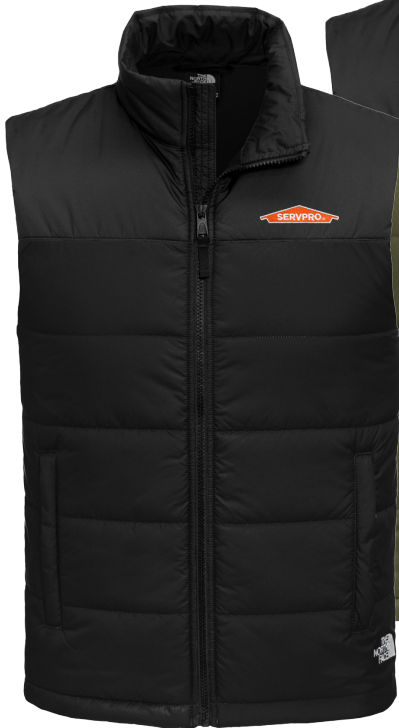
SERV5389 MEN'S TNF BLACK