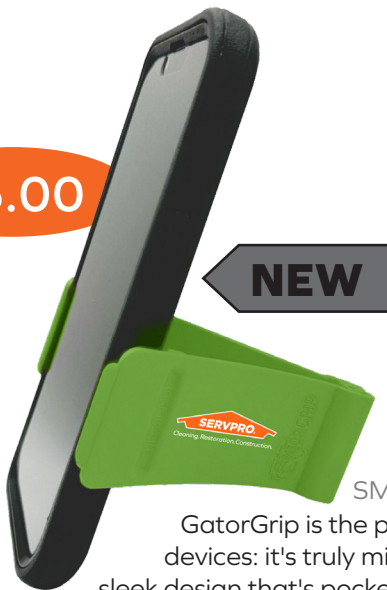
SERV9117 GATORGRIP SMARTPHONE STAND

GatorGrip is the perfect stand for your devices: it's truly minimalist with a super sleek design that's pocket-friendly, one piece, extremely compact, and requires no assembly.