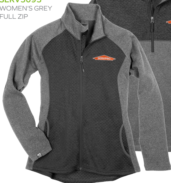
SERV5095 WOMEN'S GREY FULL ZIP