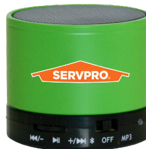
SERV1600 MINI BLUETOOTH SPEAKER

The Brick Outdoor Waterproof Bluetooth Speaker has a portable design so you can easily bring it to pool parties, camping trips, and more. Its 6W output fills any space with quality sound, while its IPX6 waterproof rating keeps it protected in wet or rainy conditions. The speaker comes with a Micro USB charging cable and a carabiner clip for on-the-go transportation. It provides up to 4 hours of playback at maximum volume when fully charged and charges from 0% to 100% in 4 hours.