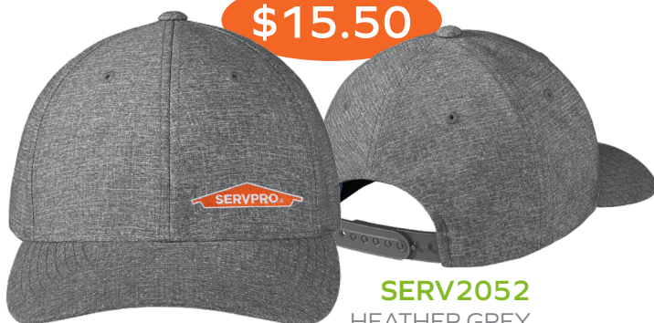
SERV2052 HEATHER GREY

Flexfit 100 technology allows for the perfect blend of Flexfit technology and adjustability for a more custom fit. It features a soft 100% polyester fabric.