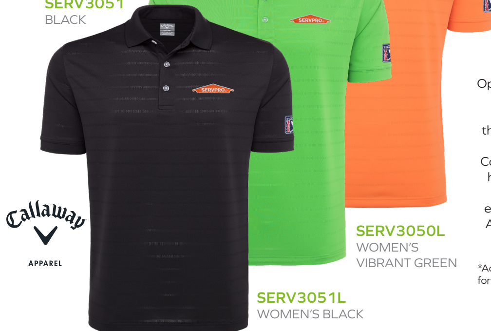
SERV3050L WOMEN'S VIBRANT GREEN