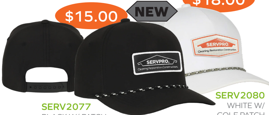
SERV2077 BLACK W/ PATCH

Unparalleled style and comfort at your next event or work day! This Performance 5 Panel Cap is a game-changer and features a visor cord decoration. Perfect for golf tournaments and seasonal events. Black cap decorated with a black and white patch, white cap is finished with a golf ball printed pattern patch.