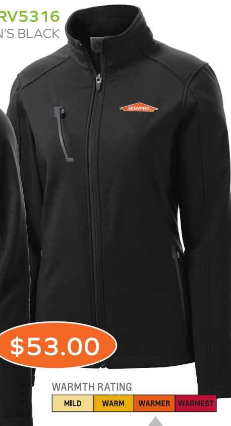
SERV5316 WOMEN'S BLACK

You'll stay warm and protected from wind and rain in this value-priced soft shell. Welding details on the pockets and at the elbows give this jacket a sharp, technical look. 100% polyester woven shell bonded to a water-resistant film insert and a 100% polyester micro-fleece lining. SERVPRO® logo embroidered on left chest. Available in men's and women's sizes Small through 4XL.