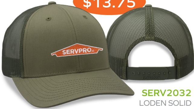
SERV2032 LODEN SOLID

The latest trend in color is this forest green mesh back hat. It features an embroidered SERVPRO® logo on the front and has a plastic snap back closure.