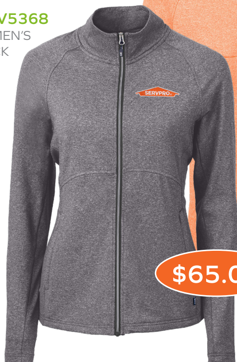
SERV5368 WOMEN'S BLACK