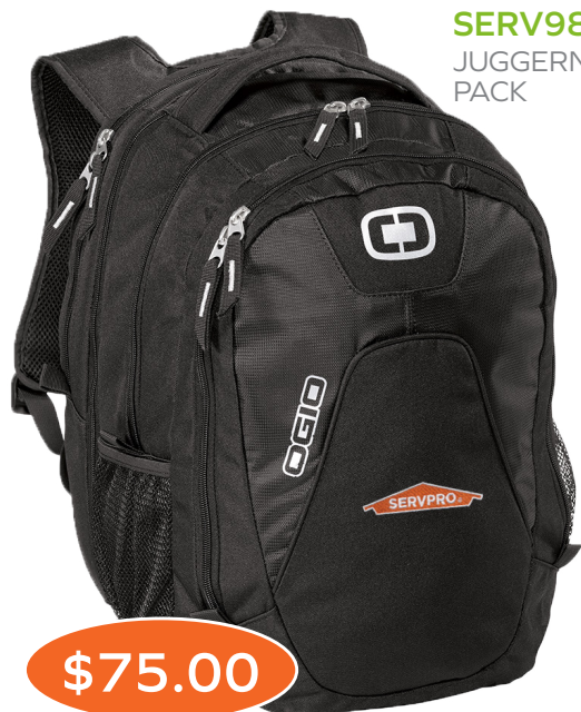
SERV9810 JUGGERNAUT PACK