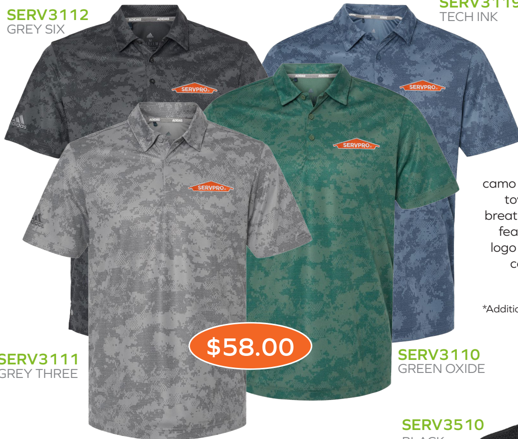
SERV3119 TECH INK