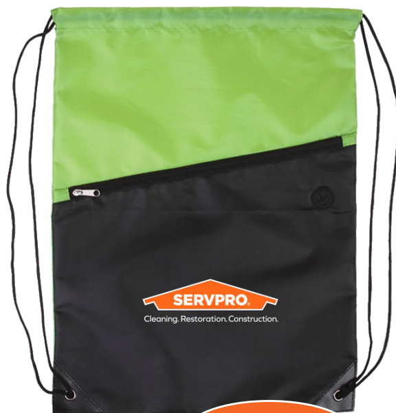
SERV9059 TWO-TONE BAG

Large front zipper tote with 29" shoulder strap. Contrasting Colors; Pen Loop. This bag measures 16.5"W x 14"H x 3"G, and is made from 600 denier polyester.