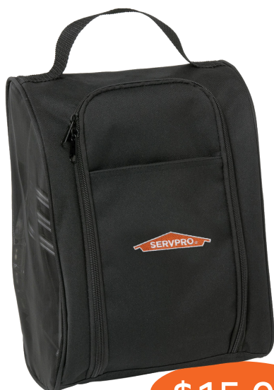
SERV9108 SHOE BAG

Drawstring backpack with large colorful main storage compartment, additional black front zip pocket and cinch up closure. Two-tone color design, front pocket and headphone slot provide added value to the classic cinch-up bag.