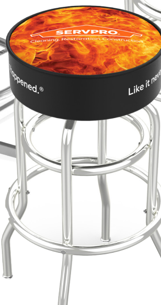
SERV1510 SHOP STOOL FIRE