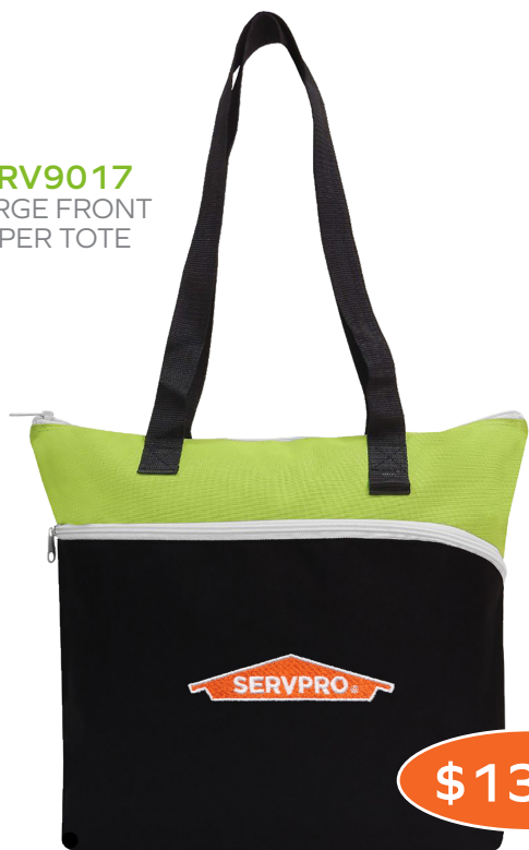
SERV9017 LARGE FRONT ZIPPER TOTE