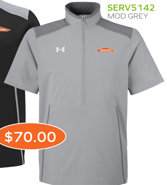
SERV5142 MOD GREY