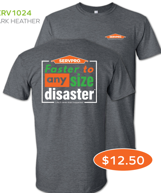
SERV1024 DARK HEATHER

SERVPRO® logo is shown on this shirt over a distressed American flag. This black t-shirt is available in sizes Small through 3XL.