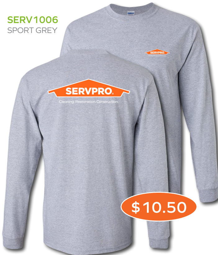
SERV1006 SPORT GREY

6.1 oz., 50/50 cotton/polyester blend, these SERVPRO® branded shirts are the perfect uniform for all of your helpers to get you through the cleanup with ease. Available in sizes Medium through 3XL.