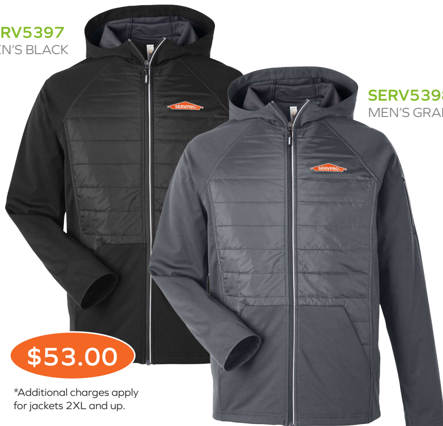
SERV5398 MEN'S GRAPHITE

*Additional charges apply for jackets 2XL and up.