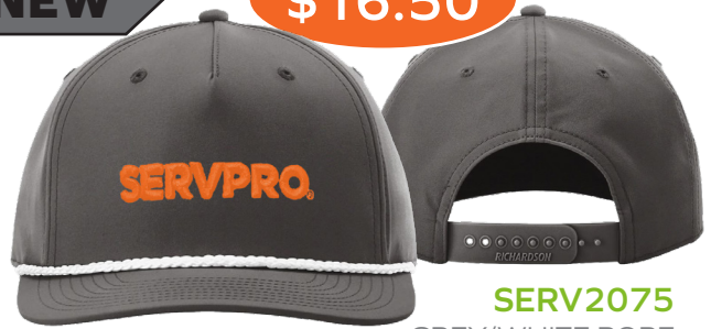
SERV2075 GREY/WHITE ROPE

This hat delivers exceptional comfort and all-day wearability thanks to its Stay-Dri sweatband and performance polyester fabrication. Add a braided bill rope, five-panel construction, and classic Mid Pro shape and you've got a classic rope cap made for modern performance.