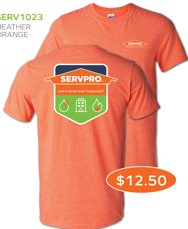
SERV1023 HEATHER ORANGE