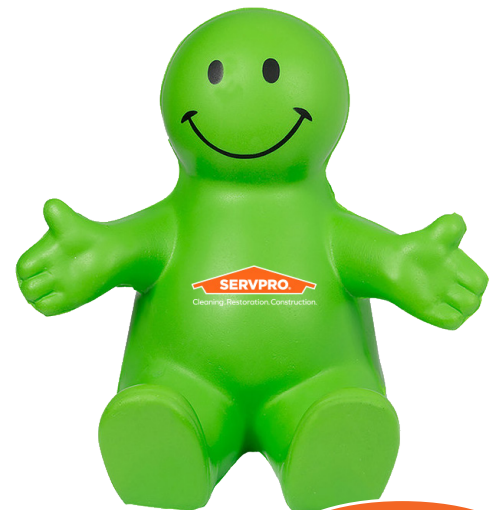
SERV9106 HAPPY DUDE MOBILE DEVICE HOLDER

Made from specially formulated, flexible materials, Gator Grip is super durable yet lightweight, and it minimizes forearm and hand pain, as well as the tingling sensation associated with holding your device for long periods.