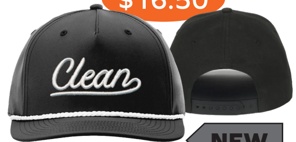
SERV2074 BLACK W/ WHITE ROPE

This hat delivers exceptional comfort and all-day wearability thanks to its Stay-Dri sweatband and performance polyester fabrication. Add a braided bill rope, five-panel construction, and classic Mid Pro shape and you've got a classic rope cap made for modern performance.